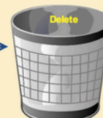
Image source: http://pixabay.com/en/trash-can-garbage-can-waste-basket-2365/ License: CC0 Public Domain Free for commercial use / No attribution required