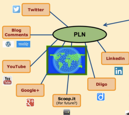
Image: Network - Networking by Gerd Altmann http://pixabay.com/en/silhouettes-network-networking-100354/ License: CC0 Public Domain Free for commercial use / No attribution required

Image source: http://pixabay.com/en/trash-can-garbage-can-waste-basket-2365/ License: CC0 Public Domain Free for commercial use / No attribution required